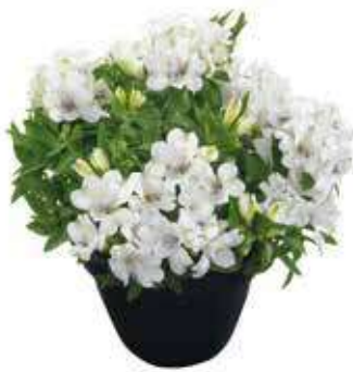
Magic White® 'TESMAGWHI'