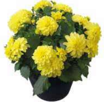
Booster Gold® 'FERBOOGOL'