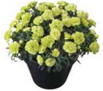
Apella Beach® 'HILBECHAPELL'

With its lush display of lavish flower, Flow® bears the greatest resemblance of all the pot carnations to the classic carnation. Despite its classic appearance, Flow® is totally contemporary thanks to the huge variety of stunning colours: white, yellow, pink, purple, green and bicolour. Flow® is easy to grow, and an easy-care plant for consumers for the garden or patio.