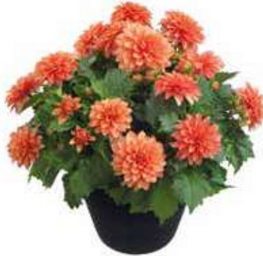
Atom Ant® 'FERATOANT'