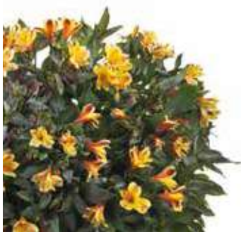
Summer Breeze® 'TESSUMBRE'