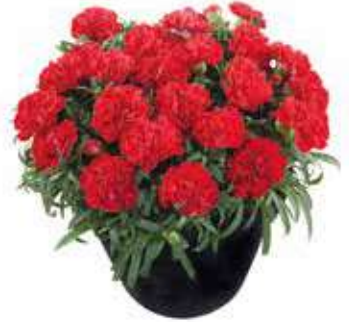
Red Bull® 'HILREDBU'