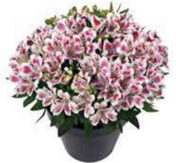
White Pink Blush® 'TESBLUSHIN'