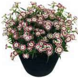
Olivia® 'SHKDIA 0912'