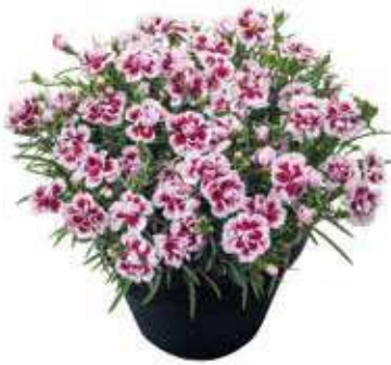
Odessa Amy® 'HILODEAMY'