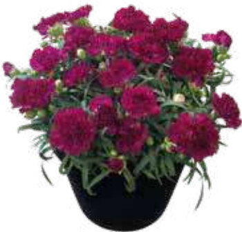
Blinky Beach® 'HILBECHBLINK'