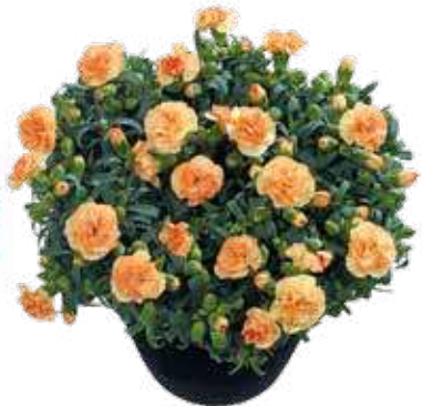
Yellow Mel™ 'CFPCYELMEL'