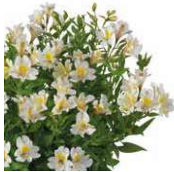
Summer Sky® 'TESSUMSKY'