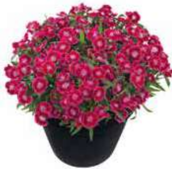
Olivia Cherry® 'HILBEAOLCHER'