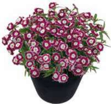
Olivia Sweet® 'HILBEAOLSWEET'