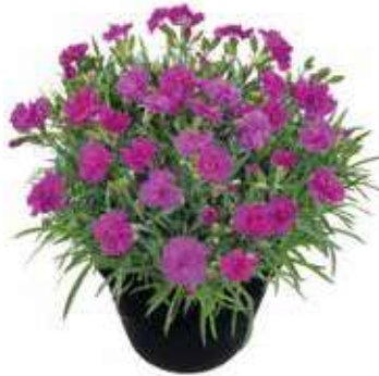
Odessa Joëlle® 'HILODEJOE'