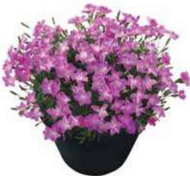
Kahori Pink® 'HOLKAHORIPINK'