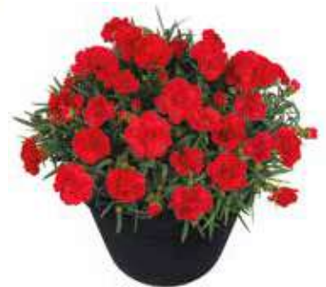
Red Allura® 'HILREAL'