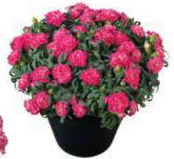
Miami Beach® 'HILBECHMIAMI'