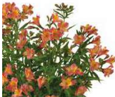
Summer Relieve® 'GASUMRELIE'