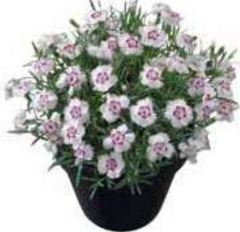
Silverado Zoya® 'HILBEAZOY'