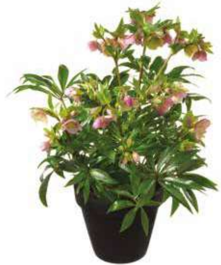
Dacaya® 'HILJWLSDACAY' NEW