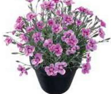
Silverado Sissi® 'HILBEASISS'