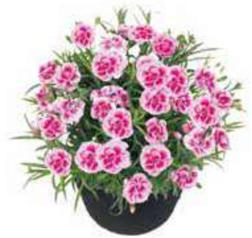
Odessa Easy Pink®