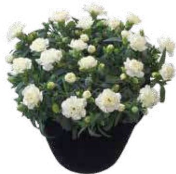
White Bay® 'HILBECHWHITE'