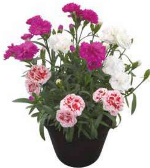
Cirque Alegria® 'HILCIRALEG' NEW