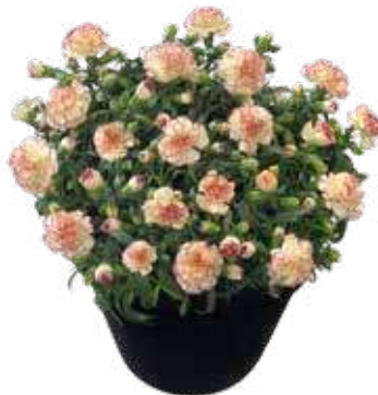
Grace Bay® 'HILBECHGRACE'