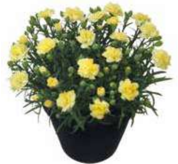
Yellow Bling Bling® 'HILYELBLBL'