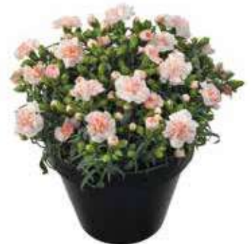
South Beach® 'HILBECSOUTH'