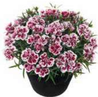
Red Esta® 'HILREES'