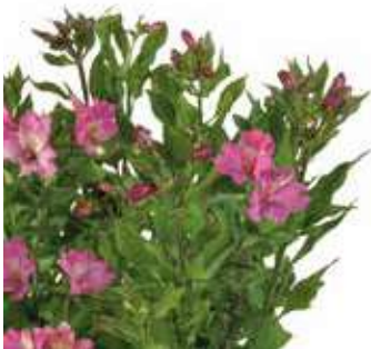
Summer Saint® 'TESSUMSAINT'