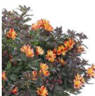
Indian Summer® 'TESRONTO'