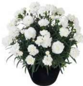
Odessa Pure® 'HILPURE'