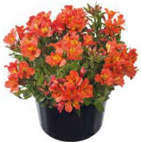
Holiday Valley® 'TESSUMHOLID'