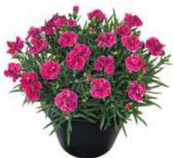
Dark pink Esta® 'HILDARPIES'