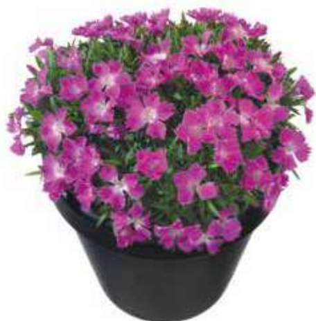
Hana Light Pink® 'SHISHI-03'