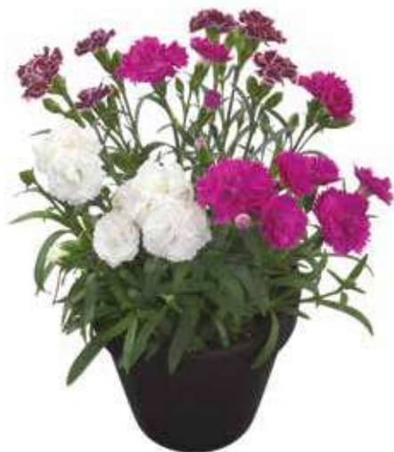
Cirque Dralion® 'HILCIRDRA' NEW