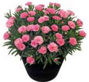
Pink Faganza® HILPINKFAGA