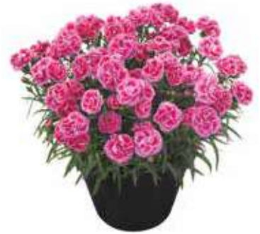
Odessa Twiggly® 'HILODETWI'

Odessa is a real garden carnation that produces large numbers of beautiful long stems, resulting in a full plant with a lovely fragrance to boot. Odessa is available in seven different colours and takes about three months to grow in spring. It can be grown in pots of 12 cm and upwards.