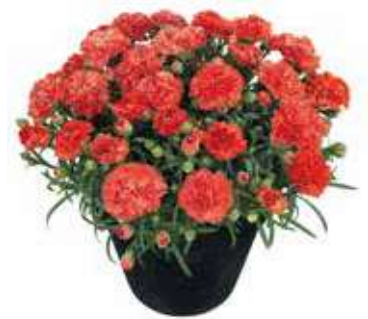
Orange Bling Bling® 'HILORBL'