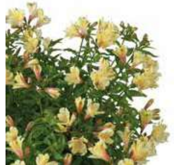
Summer Snow® 'GASUMSNOW'