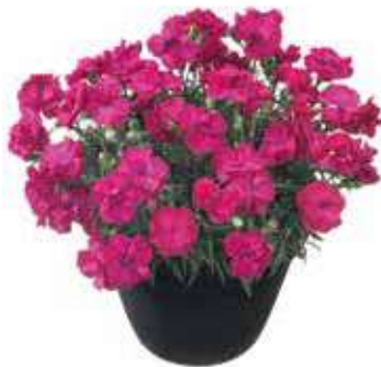
Odessa Nicki® 'HILODENICK'