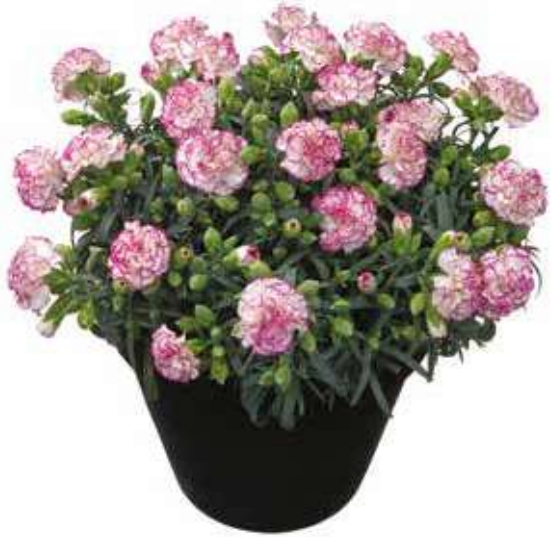
Shark Bay® 'HILBEHCANNO'