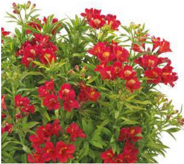
Summer Red® 'TESSUMRED'