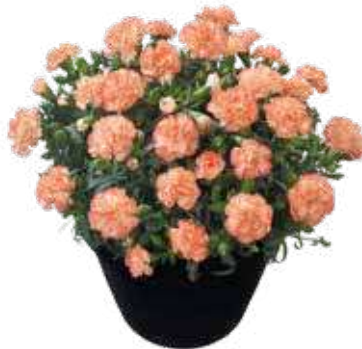
Bondi Beach® 'HILBECHBONDI'