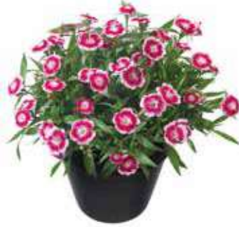
Olivia Bella® 'HILBEAOLBELL'