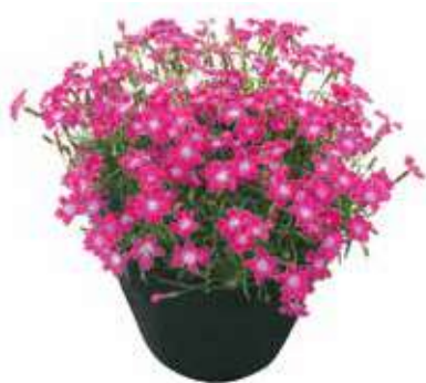
Kahori Scarlet® 'HOLKAHORISCARLET'