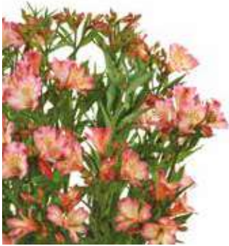
Summer Break™ 'TESSUMBREAK'