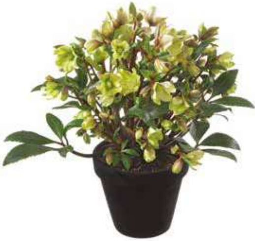
Guess® 'HILJWLSGUESS' NEW

Helleborus Interspecific JWLS are varieties displaying unique characteristics. These plants flower very early in the season for a very long period. They are heat-tolerant and appropriate for controlled growth by programmed cultivation.