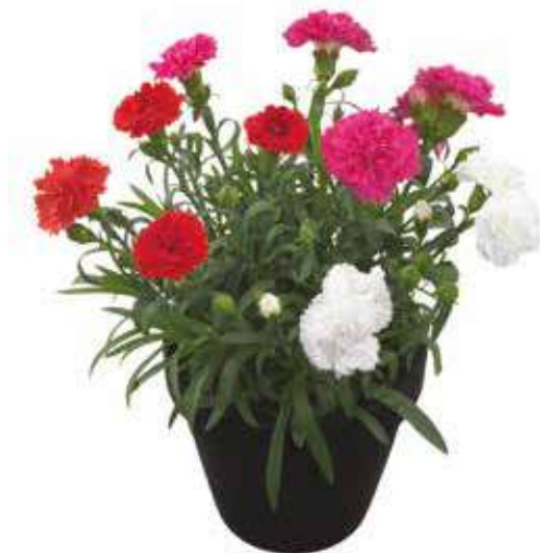
Cirque Corteo® 'HILCIRCORT' NEW

Cirque®, a swirling show of three colours in one pot! The Cirque plug contains three cuttings of different colours in one plug, you only need to transfer one plug into a pot. Cirque will bring you convenience in culture. The combinations are selected on their uniform growth and flowering. When flowering, this Dianthus turns into a swirling show of colours. We have three beautiful combinations available from week 10 to 25.