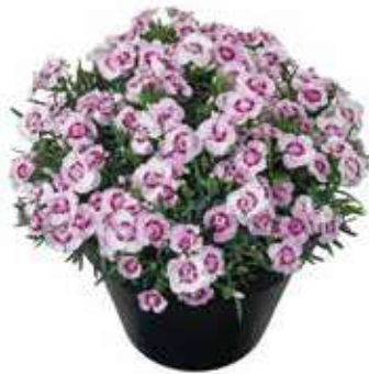
Whila Charmy® 'HILWHICHAR'