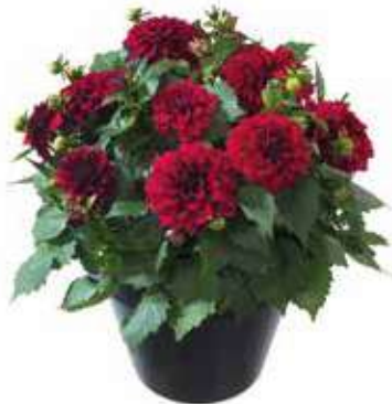
Elasti Girl® 'FERELAGIR'