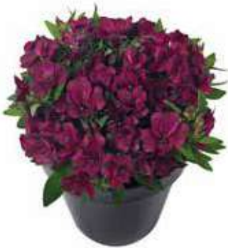
Dark Purple® 'TESDARKLIN'