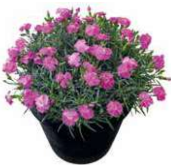
Silverado Yfke® 'HILBEAYFKE'