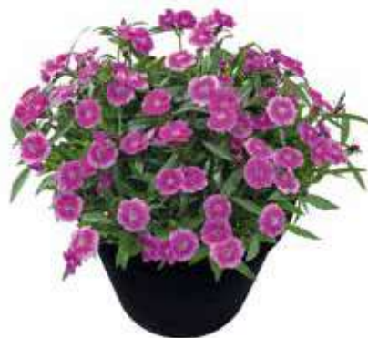
Olivia Wild® 'HILBEAOLWILD'