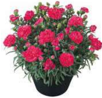
Cerise Bling Bling® 'HILCERISBLBL'