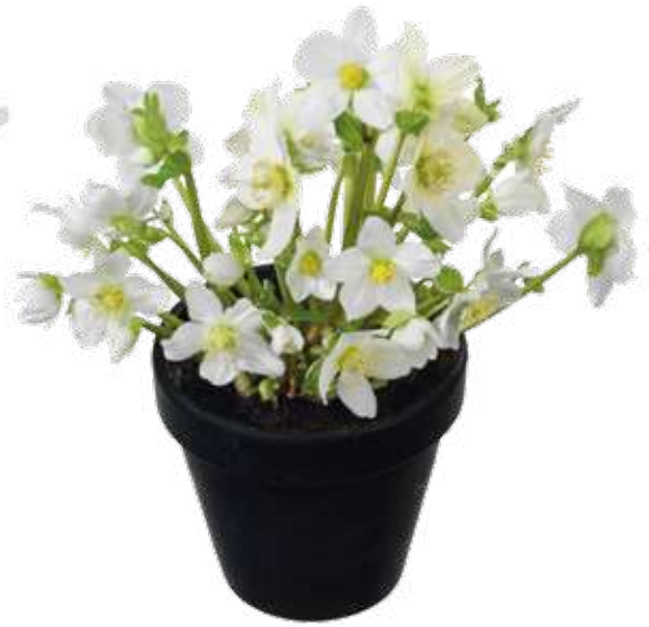
Snow Bird® 'HILNELSNOBI'