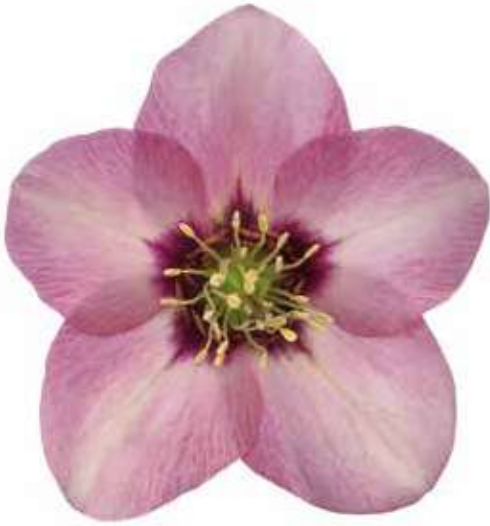
Ashwood Peach Cocktail® 'ASHWOOD PEACH COCKTAIL'

Helleborus orientalis, an Oriental Helleborus, whose great ornamental value is due to its exceptional range of colours and its special shape of flowers.