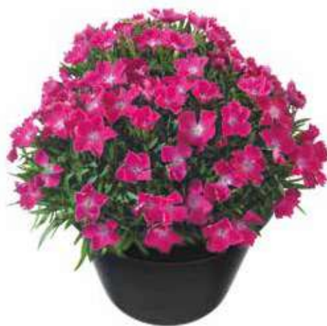
Hana Scarlet® 'SHISHI-02'