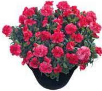
Cerise Mel™ 'CFPCERMEL'

Adorable pot carnations are known for their profuse flowering from spring until late autumn and their large, scented, double flowers. Adorable plants are perfect for growing under high temperatures and ideal for garden, patio and balcony.