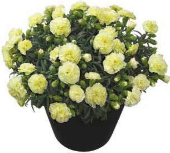
Golden Bay® 'HILBECHMAY'