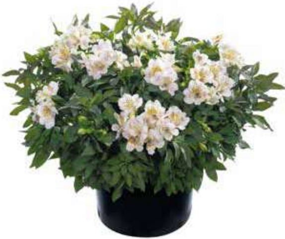
Times Valley® 'TESSUMTIME'

The Summer Paradise ranges comprises two series of abundantly blooming garden alstroemerias: Summer and Valley Series. The difference is in their height: Valley will grow to approximately 40 - 50 cm, while Summer can reach a height of 60 cm. Both series guarantee a prolific show of flowers: the plants will produce an unbroken display from May until November. They are exceptionally winter hardy and can cope with temperatures as low as -15°C.