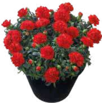
Crane Beach® 'HILBECHCRANE'